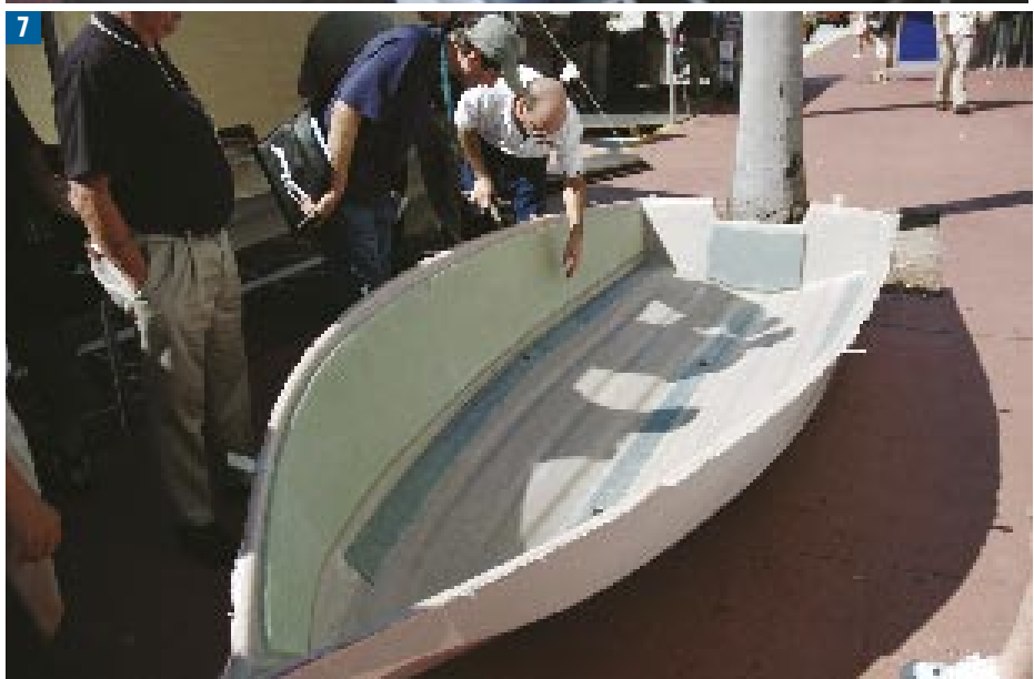
6 & 7 A demo at IBEX 2007 produced this dinghy hull. Using it is such a quick and simple process; and consumables are kept to an absolute minimum. The flow media used was supplied by Polynova, a combination of Hiflux 90 and Polybeam 703, and the core was Airex RG3 80 foam. The resin came from Ashland.